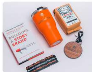
Owner Gift Franchise Sidekick